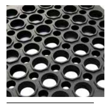
M22 upper surface Thickness. 14 mm

Colour: black - Other colours on request