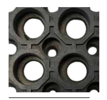
M69+ upper surface Thickness. 23 mm Ø of the holes: 29 mm

Non-binding photographs - Dimensions and weights are indicative - +/- 5% tolerance.