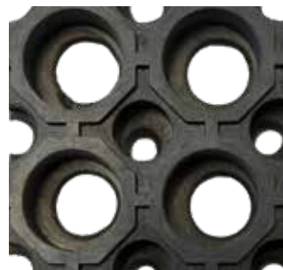
M69+ upper surface Thickness. 23 mm Ø of the holes: 29 mm