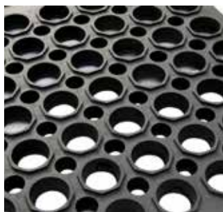
M22 upper surface Thickness. 14 mm

Colour: black - Other colours on request