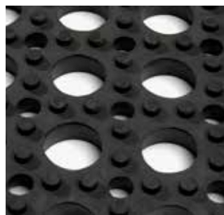
M22 lower surface