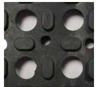
M69+ lower surface