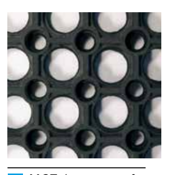
₹ M67 / upper surface