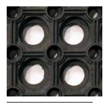
M68 / upper surface