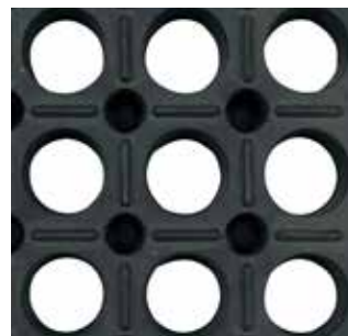
upper surface Ø of the holes: 19 mm