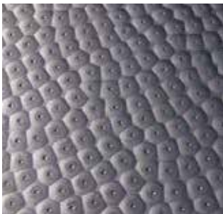
Clip 18 / upper surface

Colour: black - Other colours on request