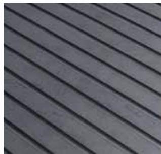
Clip 18 / lower surface